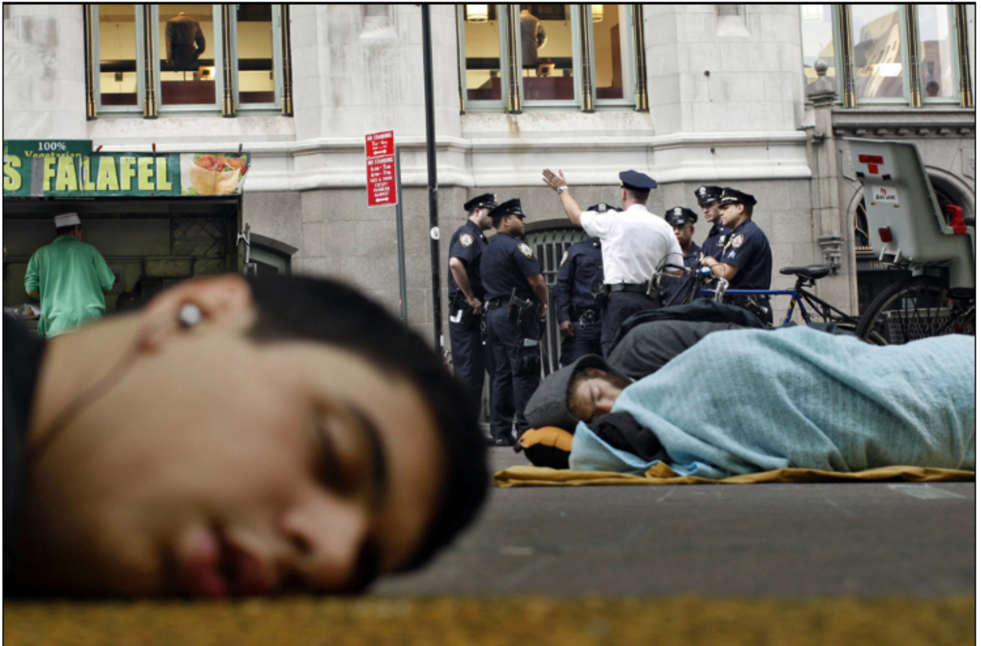
As protesters sleep in Zuccotti Park, N.Y. police officers receive instructions. A group of activists calling themselves Occupy Wall Street targeted the Financial District for more than a week of demonstrations in late September. The group said they sought to bring attention to corporate malfeasance, social inequality, and the yawning gap in income between America's rich and poor.